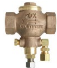
FOX DEMAND VALVE DMV25