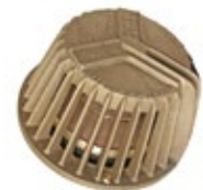
FOX DIVERSION VALVE DV150